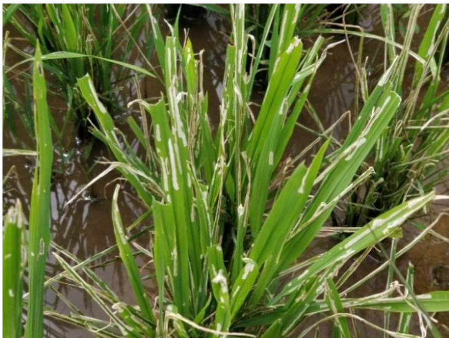
Caseworm infestation at Mandya District