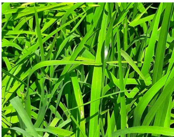
Leaf folder infestation in paddy nursery in Kashmir