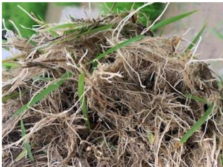
Roots of rice seedlings showing nematode galls