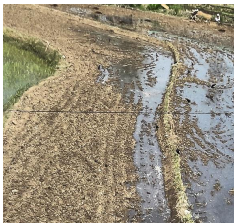
Trimming of paddy field bunds during the field preparations for pest management