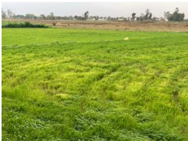
Paddy nursery showing symptoms of nematode infestation