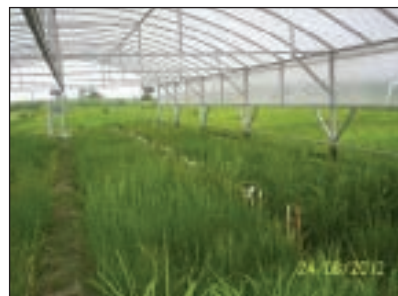
Rain Shelter facility