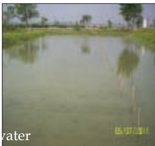
Deep water screening facility